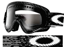
O FRAME ENDURO CARBON FIBER PRINT Vented Clear Lens - 02-037