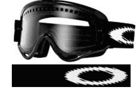
O FRAME ENDURO JET BLACK Vented Clear Lens - 01-666