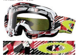
RED DIGI-SLASH Clear Lens - 01-740