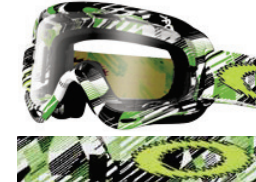
GREEN DIGI-SLASH Clear Lens - 57-332