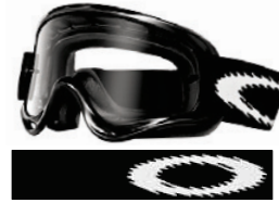
JET BLACK Clear Lens - 01-615 Dark Grey Lens - 01-713 Fire Iridium® Lens - 12-269