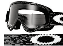
CARBON FIBER PRINT Clear Lens - 01-669 Black Iridium® Lens - 12-285