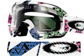
WHITE HAZMAT Clear Lens - 57-328