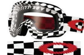
CHECKED Clear Lens - 57-333