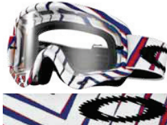
RAZORS EDGE PATRIOTIC Clear Lens - 57-684