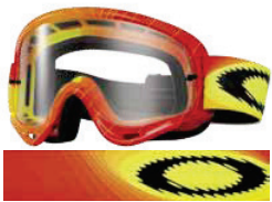
SWELL FADE RED/YELLOW Clear Lens - 57-962