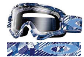
NAVY DIGI-SLASH Clear Lens - 01-717