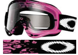
STORM PINK/BLACK Clear Lens - 57-334