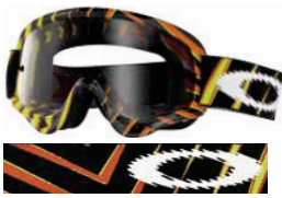
RAZORS EDGE ORANGE/YELLOW Clear Lens - 57-686