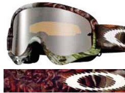
SEEDY SLEEVED Black Iridium® Lens - 57-964