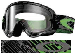
SKULL RUSHMORE GREEN Clear Lens - 57-965