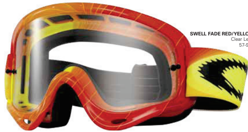
SWELL FADE RED/YELLOW Clear Lens 57-962