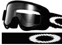
MATTE BLACK Clear Lens - 01-600 Black Iridium® Lens - 12-261