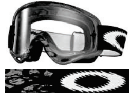
STORM GREY/BLACK Clear Lens - 57-330