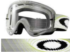
SWELL FADE GREEN/GREY Clear Lens - 57-963