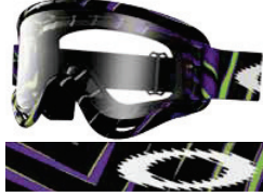
RAZORS EDGE PURPLE/GREEN Clear Lens - 57-687